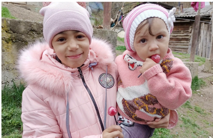
Sweet smiles at an Awana club in Ukraine