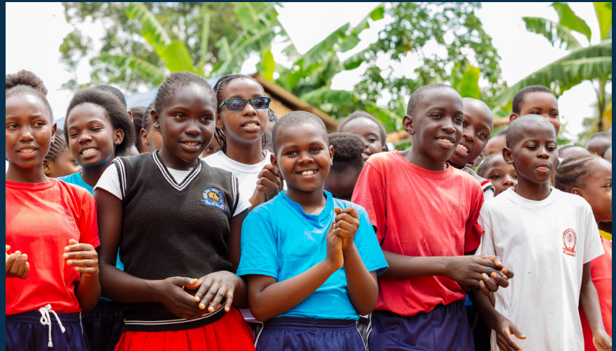
Song, dance and playful spirit at an Awana club in Kenya

“Awana is one of the main reasons I am a follower of Christ today! Through the memorization of Scripture, the Holy Spirit began to work on my heart.”